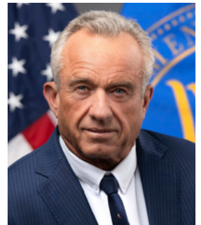
A picture of Robert F. Kennedy Junior.

Robert Kennedy is a rule maker. His job is to make rules that keep 👥 people 🤝 healthy . He made some changes to the old rules.